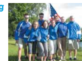
Photo above: The US Junior Orienteering team competed at the 2004 World Orienteering Championships in Estonia.